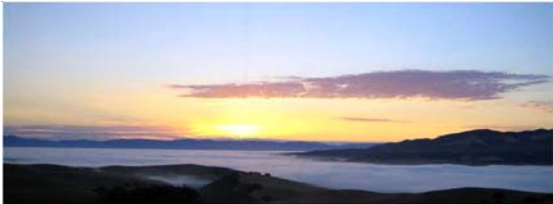
Sunrise at Fort Ord, Monterey Bay, CA