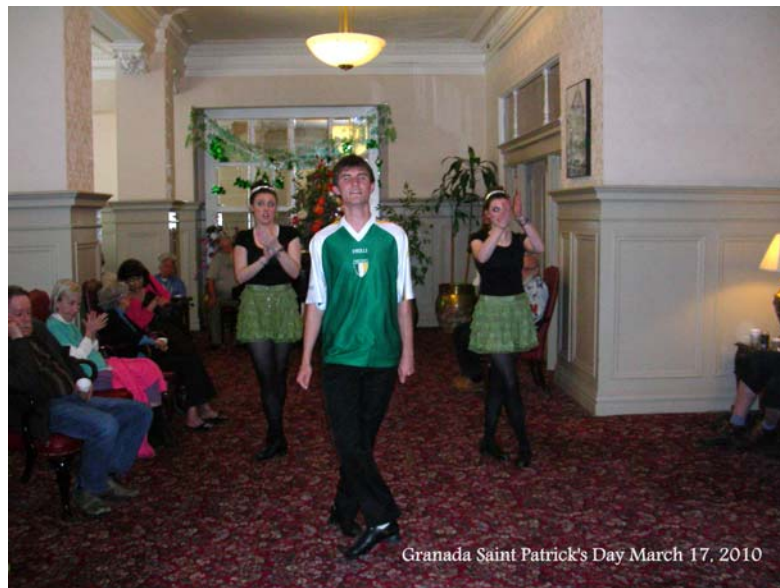
Granada Saint Patrick's Day March 17, 2010