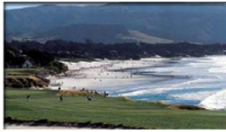
Carmel by the Sea