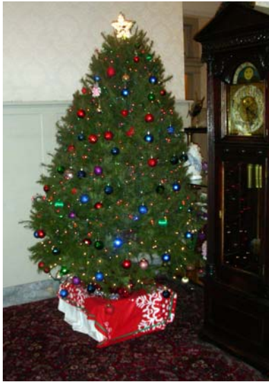
Granada Christmas Tree