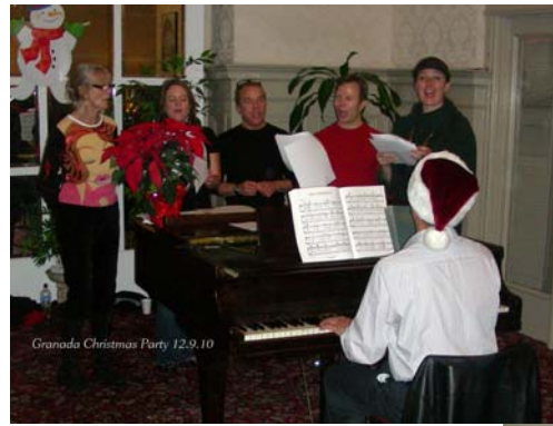
Granada Christmas Party 12.9.10