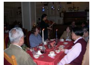
Bona Serra Senora & Senor, Bona Serra