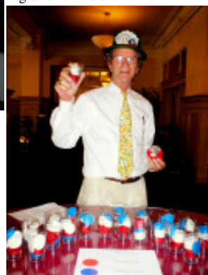
I always wanted to be a banker.

Before cards are dealt, two forced bets must be paid, they are called the big blind and the little blind . A bet is when chips are put into the pot for the first time in a hand. The amounts of the bets and blinds are predetermined, and the little blind is always half the big blind. The little blind position is always the seat to the left of the dealer, and the big blind is the seat to the left of the little blind . If you know seven card stud poker, it's about the same, after the blinds. The dealer deals two cards, face down to each player, they must then decide and place their bets after which the dealers turns up 3 cards simultaneously, called the flop , you bet; the 4th up card called the turn , you bet; the 5th up card is dealt, called the river card then the final betting." Best 5 card hand wins.