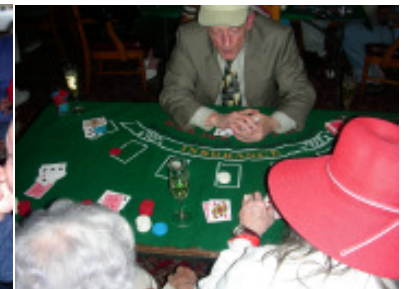
Clinton is no stranger to cards and everyone towed the line.