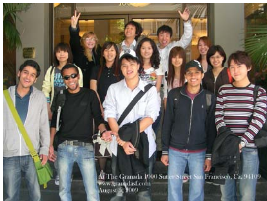
Golden Gate University English language students have started to visit The Granada regularly to talk and share.