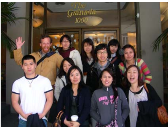
INTRAX International Institute students come often to entertain and enjoy the talk, talk, talk. They are always fun, fun,